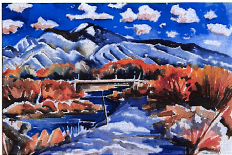
Dean Porter, Winter Stream , watercolor, 15 x 22"

Information: (575) 751-0369, www.couse-sharp.org/2015gala