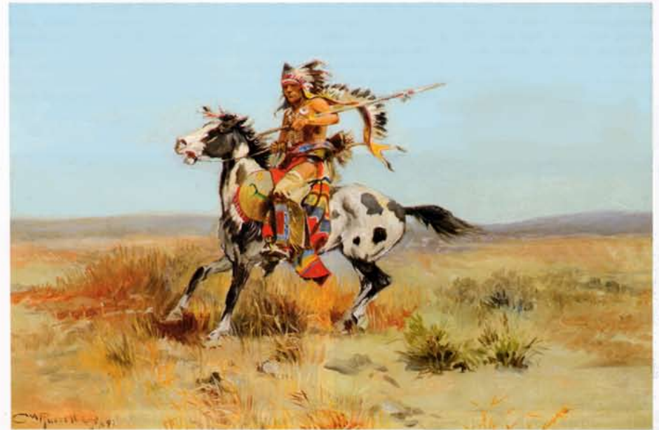
Charles M. Russell (1864-1926), Dakota Chief , 1897, oil on board, 12 x 18" Estimate: $500/700,000