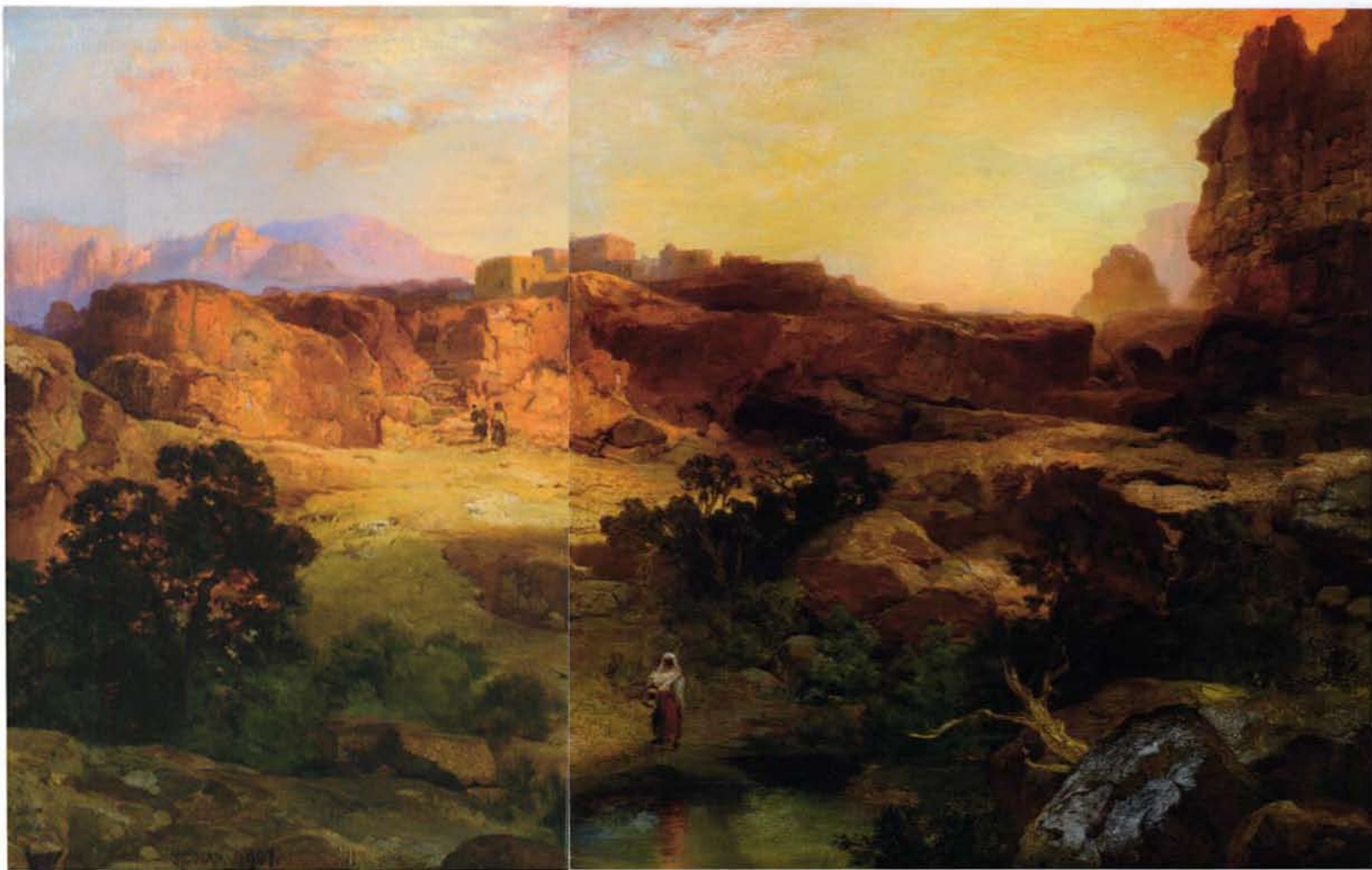
Thomas Moran (1837-1926), A Water Pocket, Northern Arizona, 1907 , oil on canvas, 20 x 30" Estimate: $1.5/2.5 million

The sale's cover lot, William R. Leigh's Dodging Lead (1943), is one of the artist's finest works and is sure to have stiff competition. Considered to be one of the most accomplished high-action painters of the West, Leigh's museum-quality piece shows a bandit being chased. "The action is a terrific example of