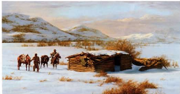
Howard Terpning (b. 1927), Too Many Snows , 1985, oil on canvas, 36 x 60" Estimate: $400/600,000