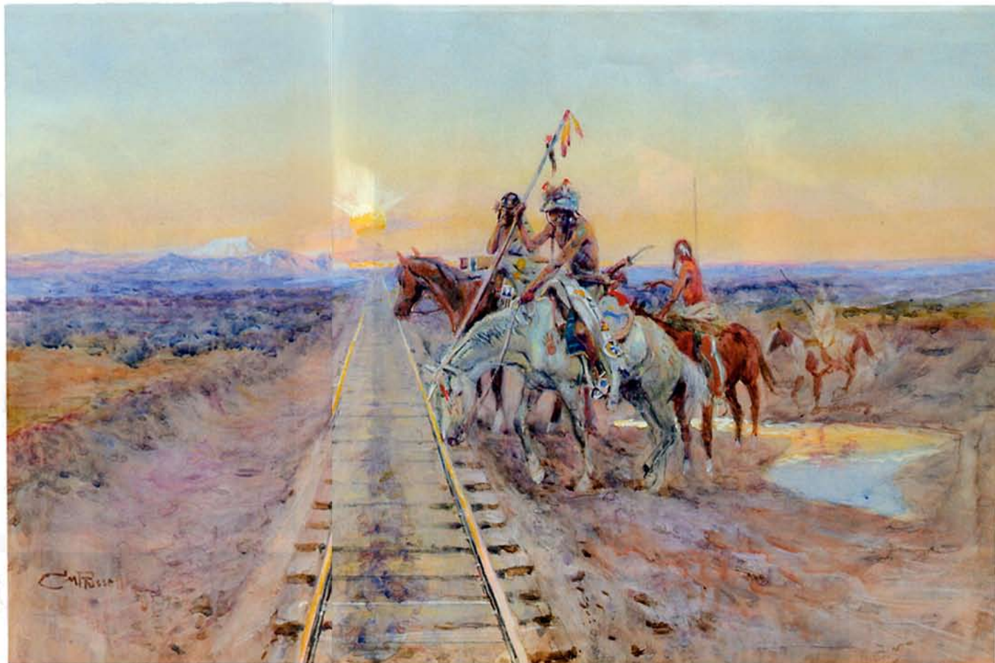
Charles M. Russell (1864-1926), Trail of the Iron Horse , 1924, watercolor on paper, 17½ x 27½" Estimate: $1.5/2.5 million