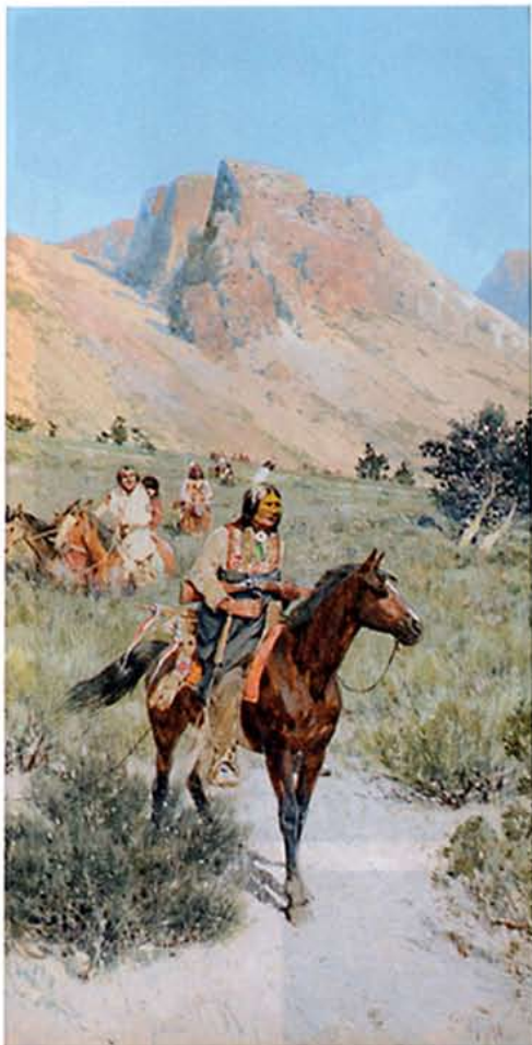
Henry Farny (1847-1916), Strange Country , 1891, gouache on paper, 16½ x 9" Estimate: $300/500,000