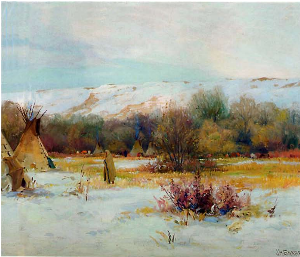
Joseph H. Sharp (1859-1953), Crow Camp , oil on canvas, 24 x 30" Estimate: $250/350,000