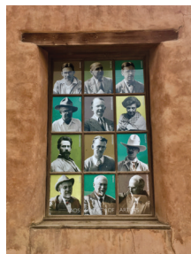
Images of the 12 Taos Society of Artists members enliven a front window of the research center building; the temporary display has proven popular with Taos passersby.

THE RESEARCH CENTER: Our initial focus is to raise $3 million to acquire and renovate the facility, and then to operate the Center for at least five years after completion. A breakdown: