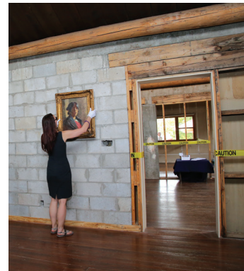
Interior demolition of the Mission Gallery building has been completed and final architectural drawings and planning are in progress in preparation for letting of construction contracts.

Together, we will build on the solid foundation that has been laid and fulfill the vision of an entire campus dedicated to the early Taos Art Colony and the Taos Society of Artists.