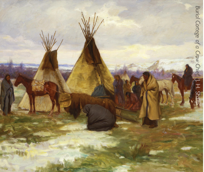
Burial Cottage of a Crow Chief | J. H. Sharp

Unless otherwise stated, all text and images © The Couse Foundation