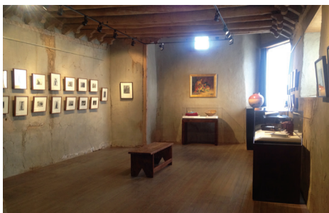
Taos Pueblo Portraiture: The Photographic Studies of E. I. Couse exhibition in The Couse-Sharp Historic Site's Luna Chapel

On July 6, the foundation opened its 2019 Luna Chapel exhibition Taos Pueblo Portraiture: The Photographic Studies of E. I. Couse . The featured prints are from 1906 to 1928 and most were taken as studies to use in developing the compositions for his paintings. The selection represents the quality of these images and provides insight into how the artist used them for his work.